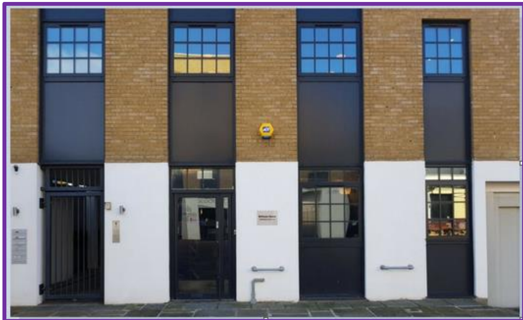
Street view data copyright Google 2017